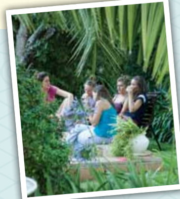
Braai time at the YW

Days can be long with many challenges but the door of opportunity is awesome, and God is at work in every area of our lives. Young lives, entering a career in the BIG City of Cape Town. Mom's and dad's wondering how their daughters are going to cope!